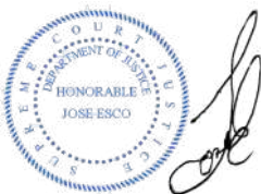
Jose Esco Supreme Court Justice